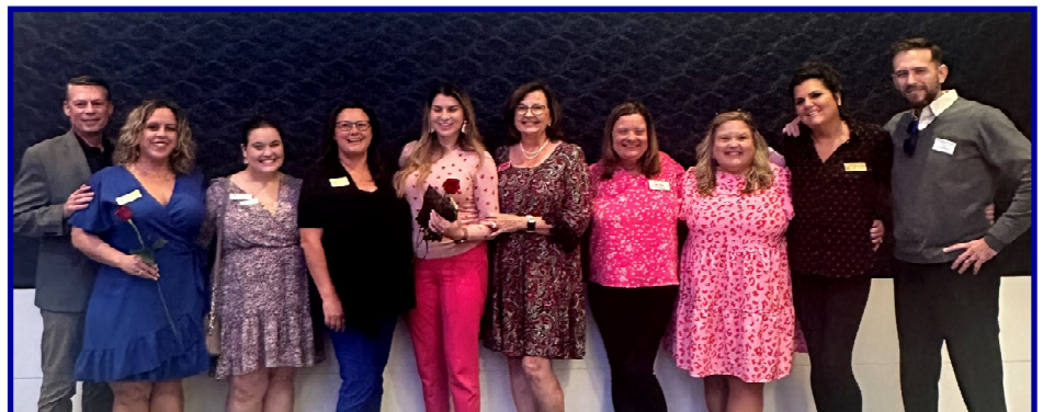
LEADERShip Alumni Class 32