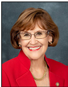
Gayle Harrell Class 3 Florida Senate Dist. 3