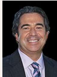
Florida Commissioner Port Sewall