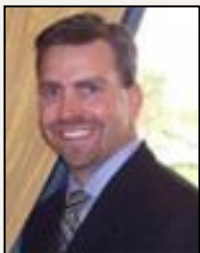
Florida House of Representative District 83