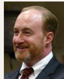
Martin County Judge Group 1