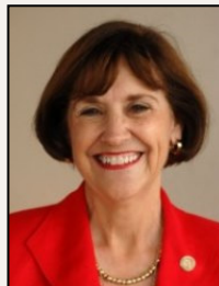
Florida Florida Senate District 25