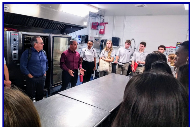
House of Hope