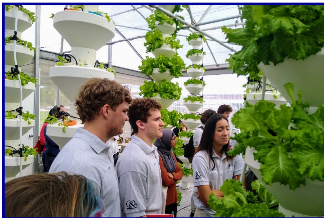
Palm City Farms Produce & Market