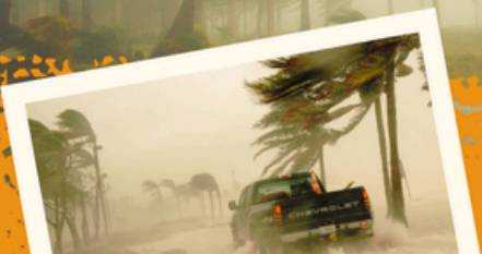
In the aftermath of devastating hurricanes, entire communities are left in need of assistance