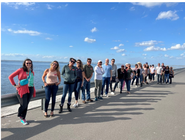
Class 32 lined up for their visit at the C-44 Canal and a visit to a local ranch.