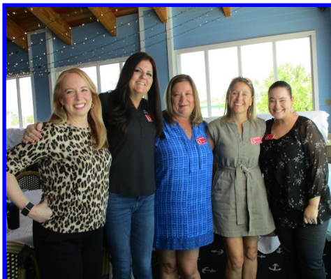
Class 32 Leaders

Class 32 and Alumni attending the LEADERship Alumni Luncheon held at Twisted Tuna on February 22, 2023