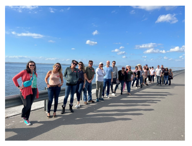
Class 32 lined up for their visit at the C-44 Canal and a visit to a local ranch.