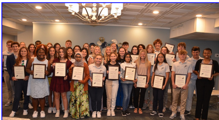
Youth LEADERship Students of Class 24

The program, which was initiated by LEADERship Martin County Alumni , would not be possible without their support and other sponsors.