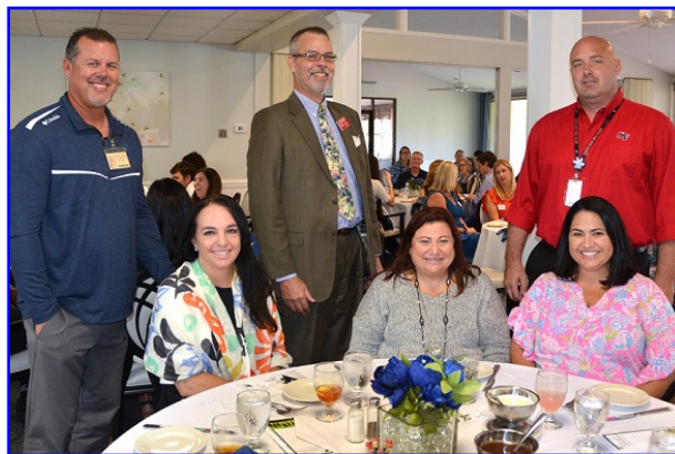
School liaisons & facilitator