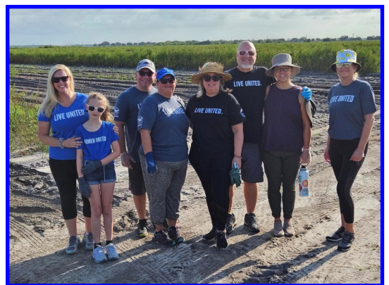
LEADERS United Community Volunteers At Martin County Healthy Start